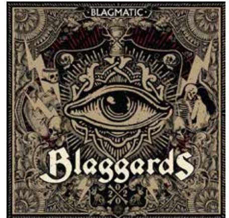
BLAGMATIC , released July 2021.

Blaggards released their latest album BLAGMATIC in July 2021, and our latest single release “Come Out Ye Black & Tans” hit streaming services on March 13, 2022.